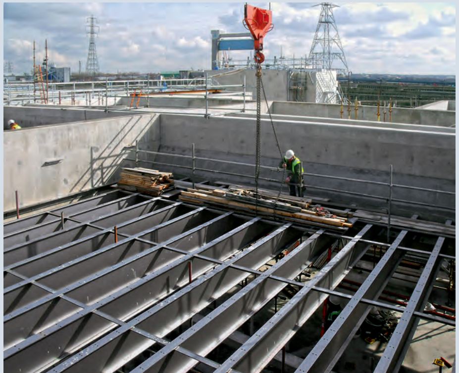
A framework of duplex stainless steel beams support the lamella clarifiers.

They also must be highly corrosion resistant, not to be compromised throughout the 60-year design life of the plant. The beams were initially specified as epoxy-coated carbon steel, but it was recognized that there would be a high risk of damage to the coating during installation and maintenance. This would have resulted in rusting of the carbon steel beams and subsequent damage to the £7 million desalination membranes.