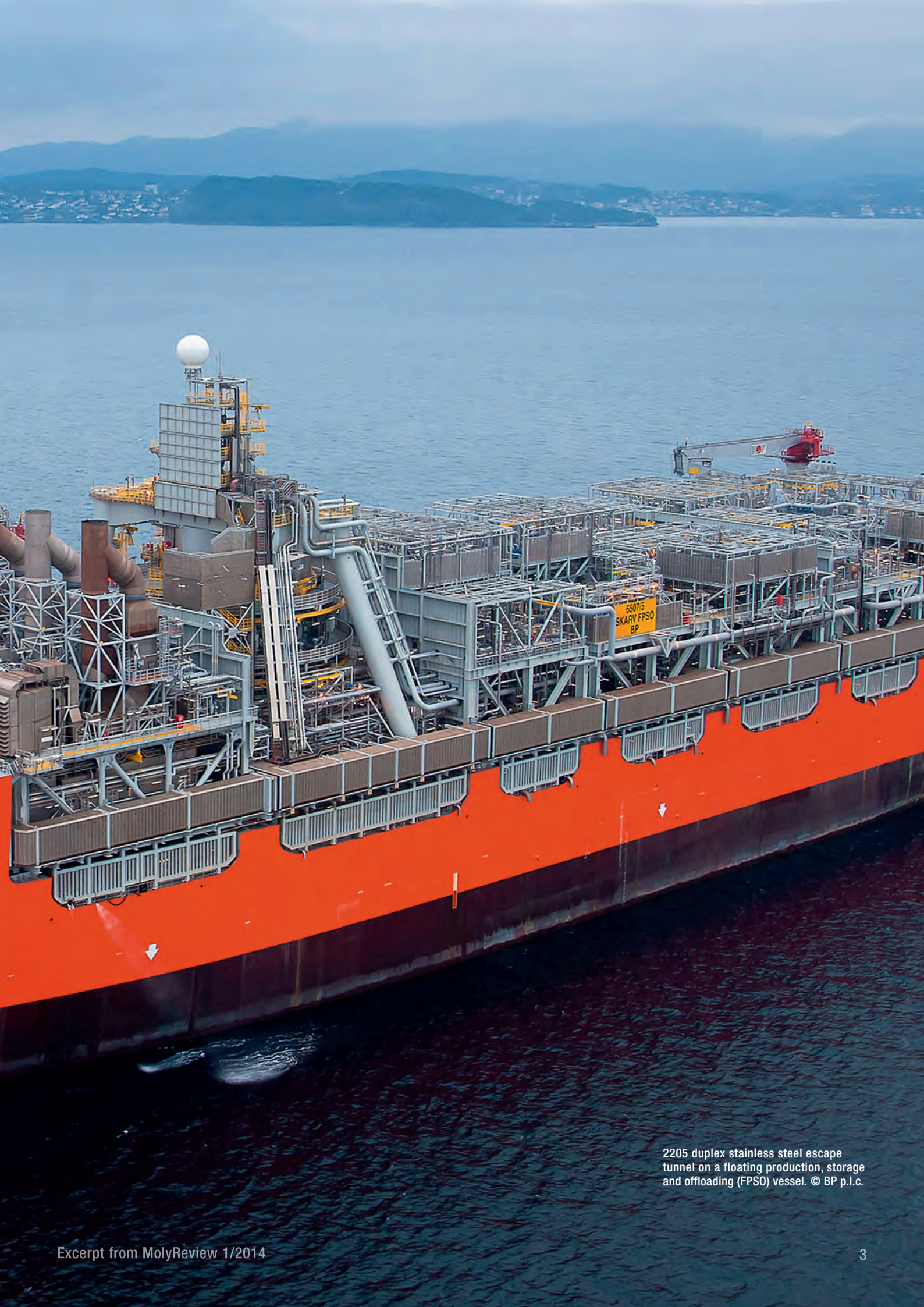
2205 duplex stainless steel escape tunnel on a floating production, storage and offloading (FPSO) vessel.