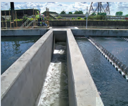
Desalination Plant at Thames Gateway Water Treatment Works, East London.

The water first passes through lamella clarifiers, containing a coarse filter medium, to remove solid particles. The clarifiers are large open tanks, supported by a framework of 78 I-beams. These beams need good strength and stiffness.