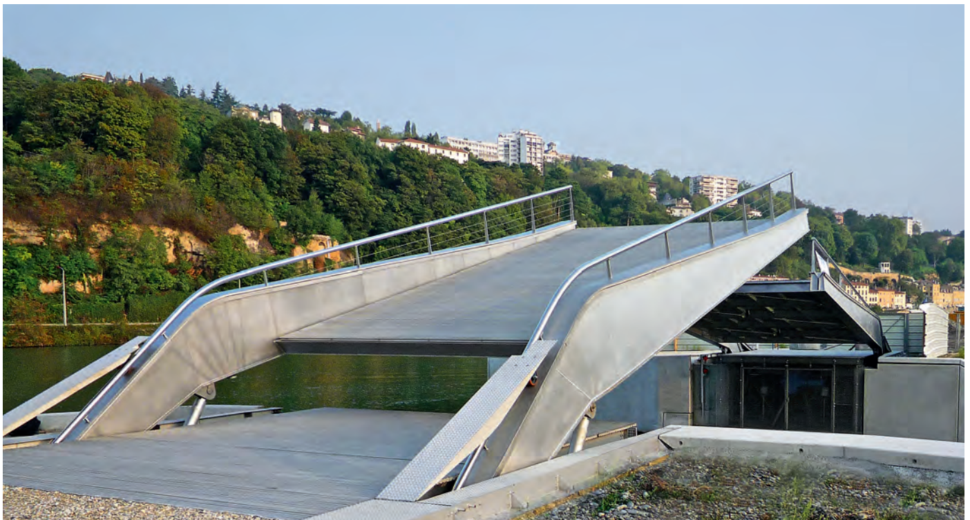
The Passerelle Mobile footbridge in Lyon-Confluence, designed by PCCP and ALTO, has 2205 duplex stainless steel structural members. Their strength allowed a considerable reduction of the size and thickness of the sections and the weight of the bridge.

The key advantages of stainless steel for load-bearing applications include corrosion resistance and hence durability even in corrosive environments, better retention of strength in fires compared to carbon steel, high impact resistance, good cleanability and a pleasing appearance.